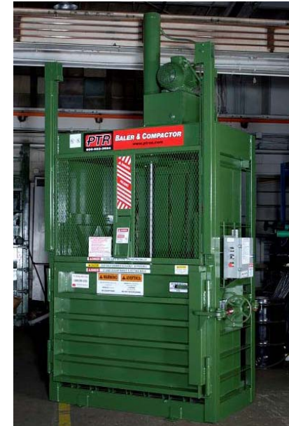
Baler - Compacts mass quantities of recyclable items such as Cardboard, Paper, Plastics, etc.