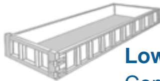
Low Boy 10 Cubic Yard Bin for Concrete, Dirt, or Rocks