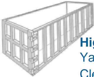
High Side 40 Cubic Yard Bin for Larger Clean-ups