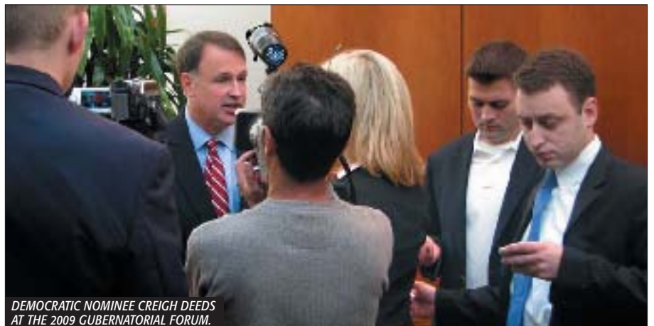
DEMOCRATIC NOMINEE CREIGH DEEDS AT THE 2009 GUBERNATORIAL FORUM.