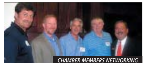
CHAMBER MEMBERS NETWORKING.