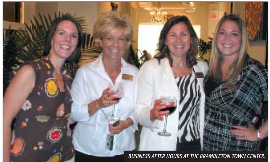
BUSINESS AFTER HOURS AT THE BRAMBLETON TOWN CENTER.

There is no better way to cement a business relationship than during a round on one of Loudoun's premier golf courses. The Annual Golf Classic is Loudoun's premier business golf event, where you can entertain key clients and