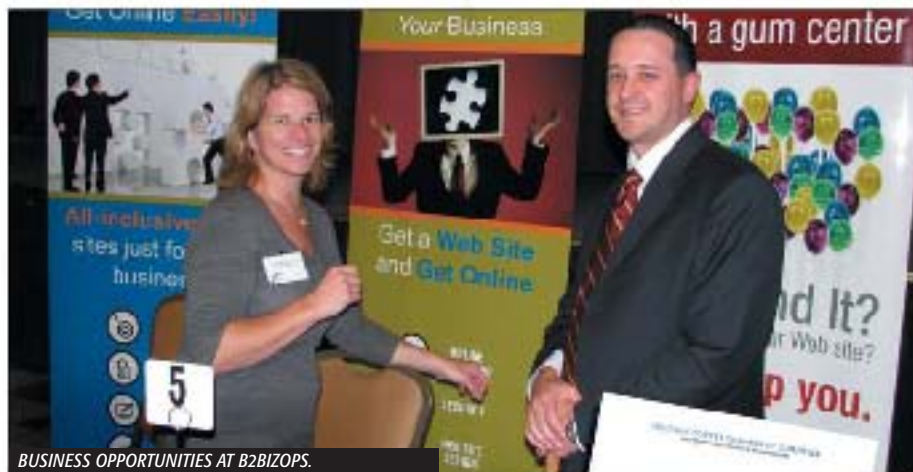
BUSINESS OPPORTUNITIES AT B2BIZOPS.

new opportunities with government agencies and larger companies.