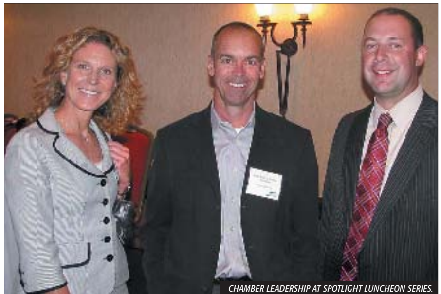
CHAMBER LEADERSHIP AT SPOTLIGHT LUNCHEON SERIES.

Because Loudoun County is such a rapidly evolving community, the Spotlight Luncheon Series was created to help Chamber members stay on top