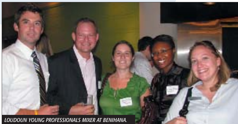
LOUDOUN YOUNG PROFESSIONALS MIXER AT BENIHANA.