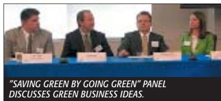
"SAVING GREEN BY GOING GREEN" PANEL DISCUSSES GREEN BUSINESS IDEAS.

Loudoun's employers can find the right talent that every company needs to succeed at the Loudoun Chamber Job Fair . The Technology Forum is built around providing area