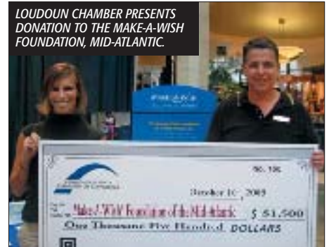
LOUDOUN CHAMBER PRESENTS DONATION TO THE MAKE-A-WISH FOUNDATION, MID-ATLANTIC.

Belonging to a LeadShare group is like having an extended team of business development professionals all looking for your next new customer. The Loudoun County Chamber has nine thriving LeadShare Groups reaching in every corner of Loudoun.