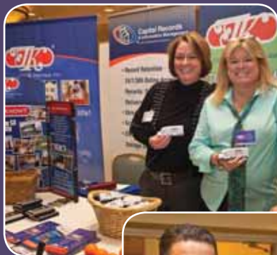
JK Moving & Storage

nonprofit clients, but the institution proudly lends financial support to more than 60 civic and community organizations across the region, focusing on five distinct categories: education, the arts, health & human services,