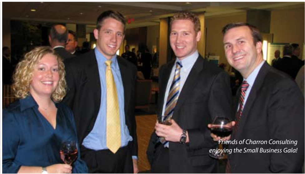
Friends of Charron Consulting enjoying the Small Business Gala!