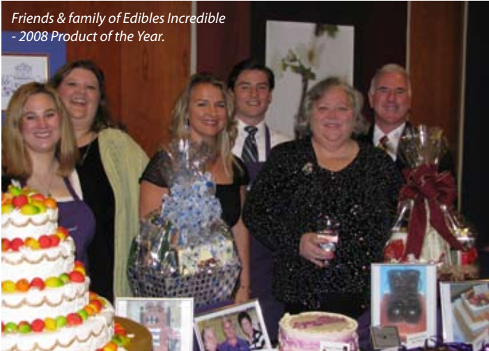
Friends & family of Edibles Incredible - 2008 Product of the Year.