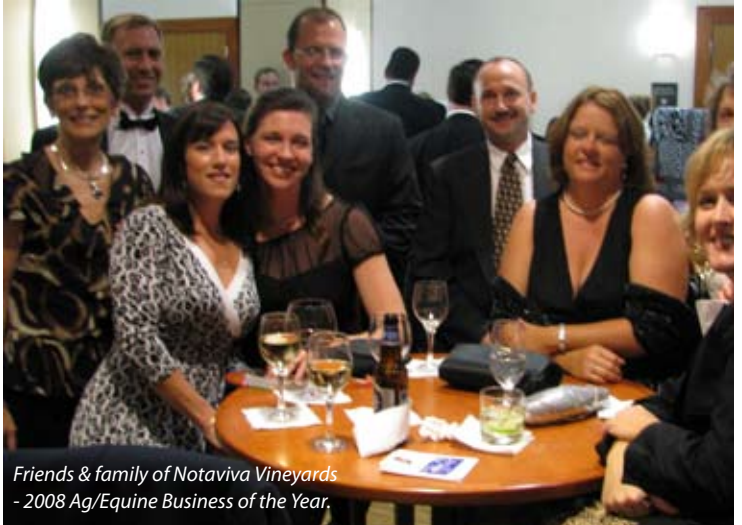
Friends & family of Notaviva Vineyards - 2008 Ag/Equine Business of the Year.